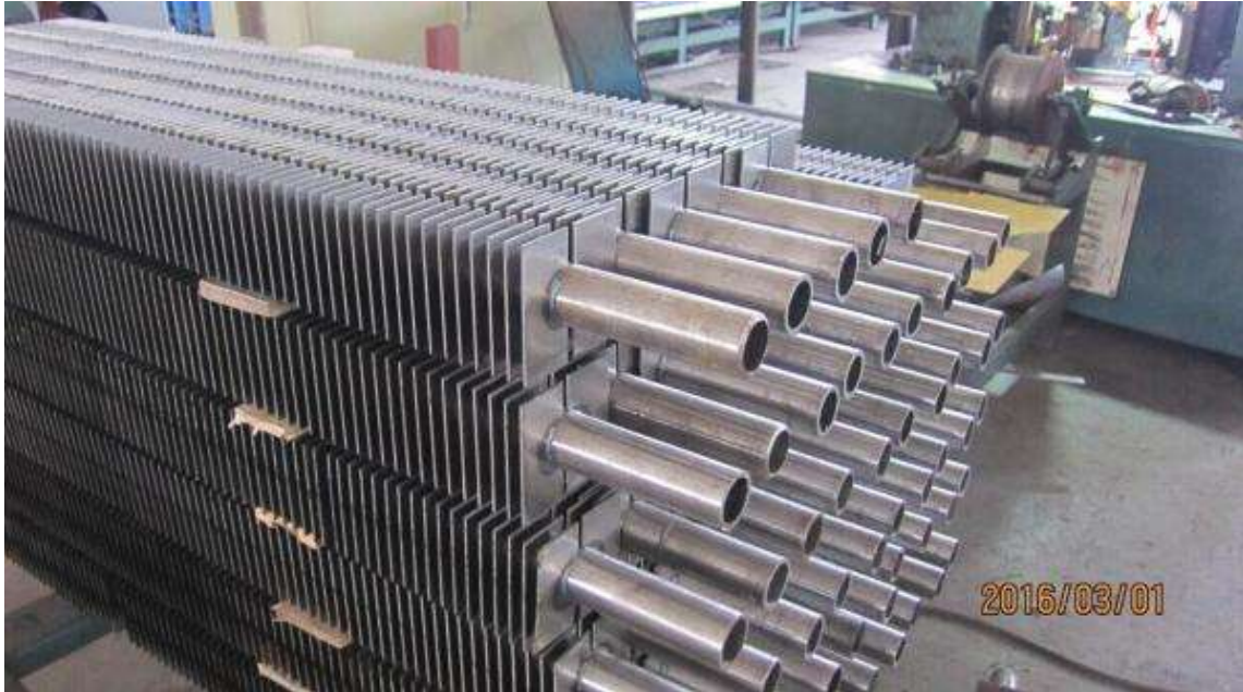
A192 SMLS H Bolier Square Heat Exchanger Fin Tube

ASTM A192 Finned Tube is a heat exchange element. In order to improve the heat exchange efficiency, fins are usually added to the surface of the ASTM A192 seamless heat exchange tube to increase the outer surface area (or inner surface area) of the heat exchange tube, so as to achieve the purpose of improving the heat exchange efficiency.