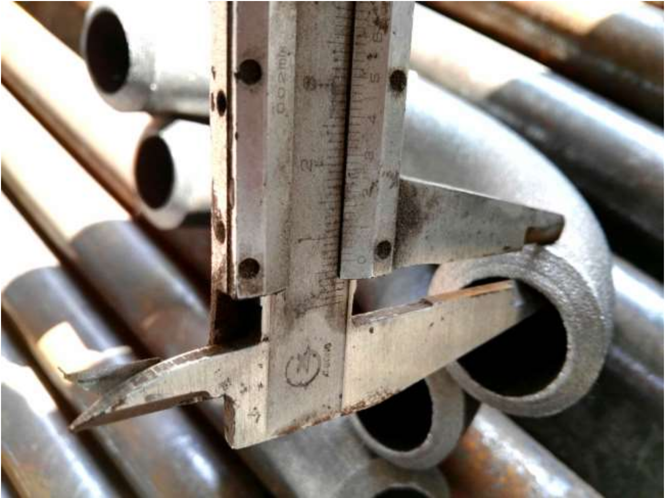
Fittings wall thickness