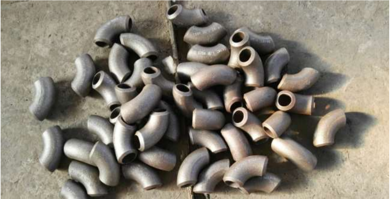
Item2 elbows all