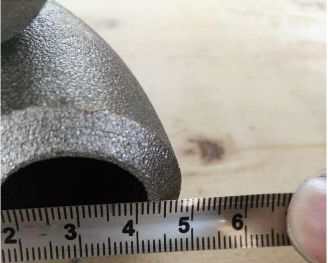
item4 centre lined radius_144mm detail