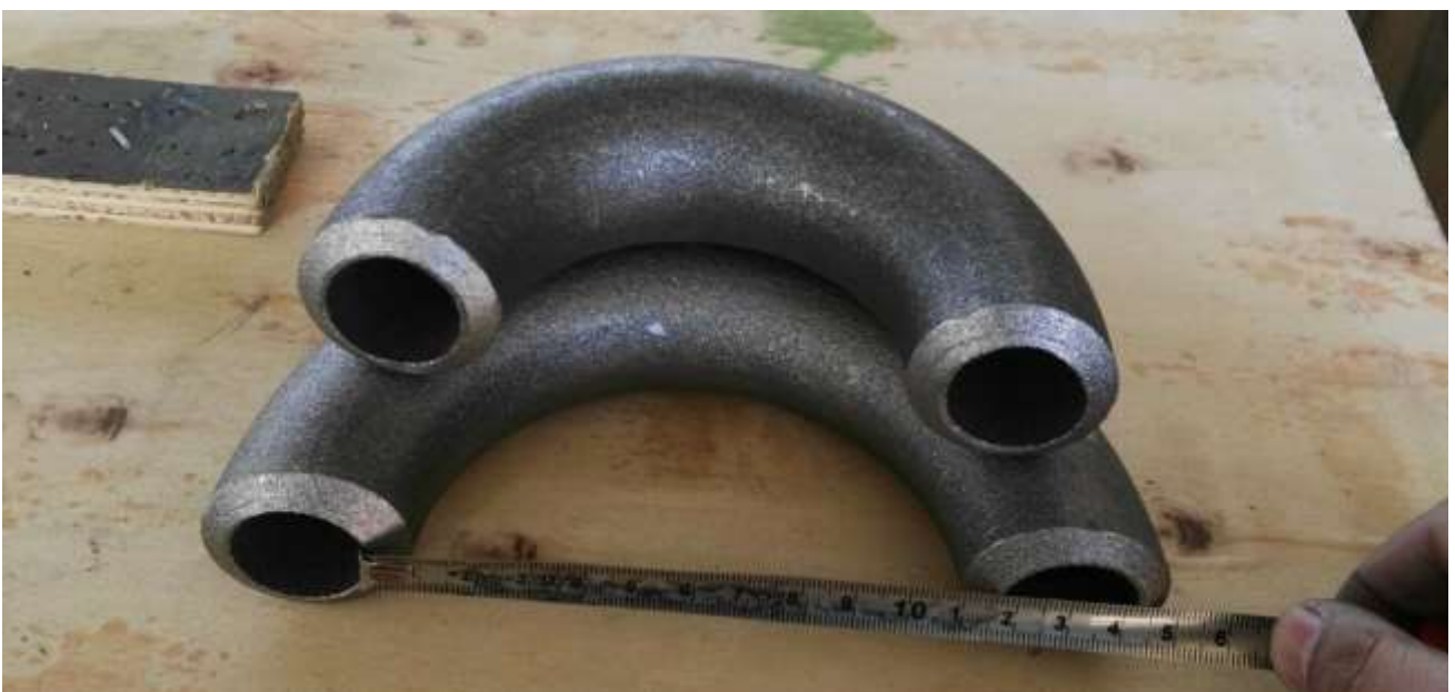
item4 centre lined radius_144mm full