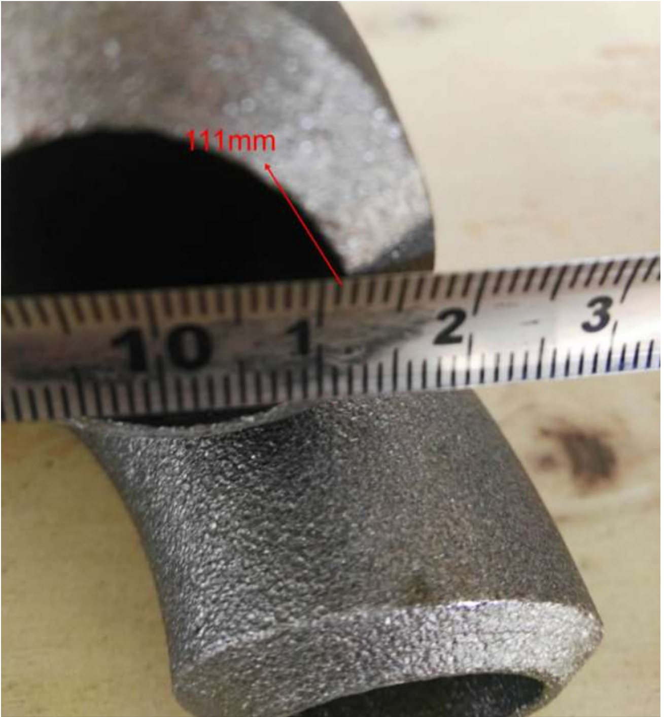
item3 Centre lined radius_111mm detail