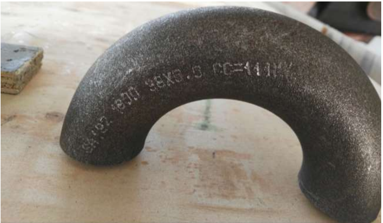
Item 3 bend marking