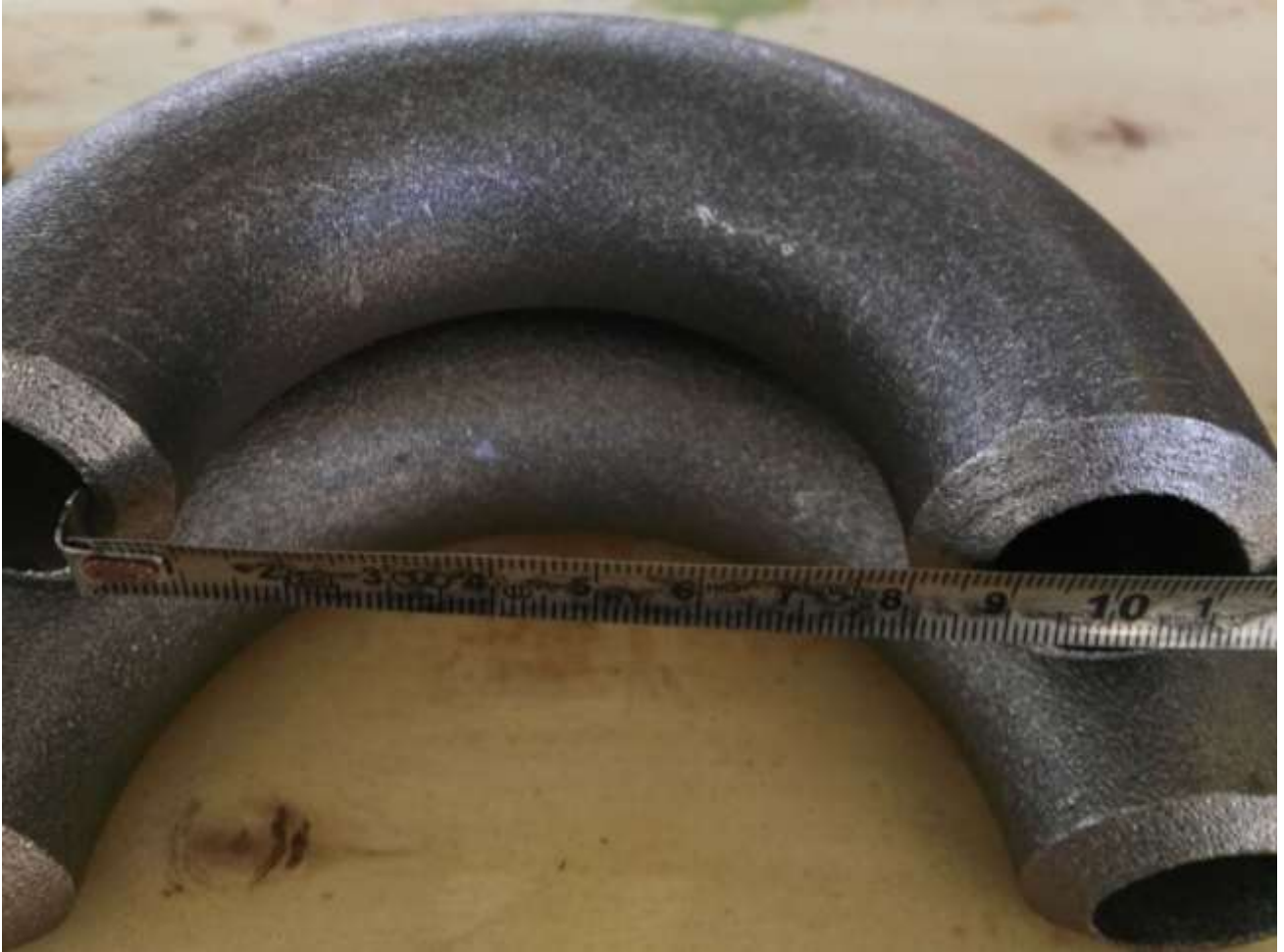
item3 centre lined radius-111mm full