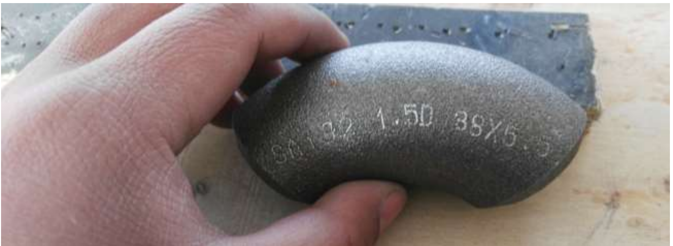
Item2 elbow marking