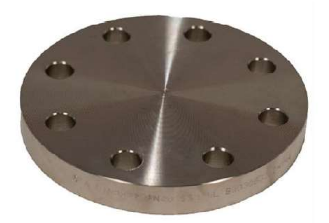
Flat Face (FF) Blind Flange

A blind flange is useful for making repairs to a pipeline further up the line. In fact, during construction of a pipeline, a blind flange may be built into the final length of pipe. This allows for expansion or continuation of the pipeline simply by adding onto the final flange.