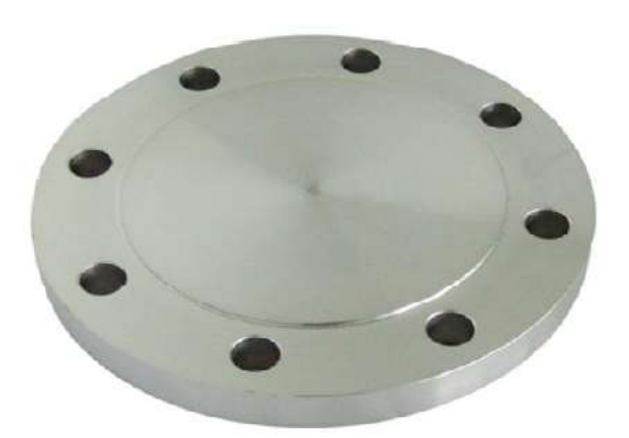
Raised Face (RF) Blind Flange