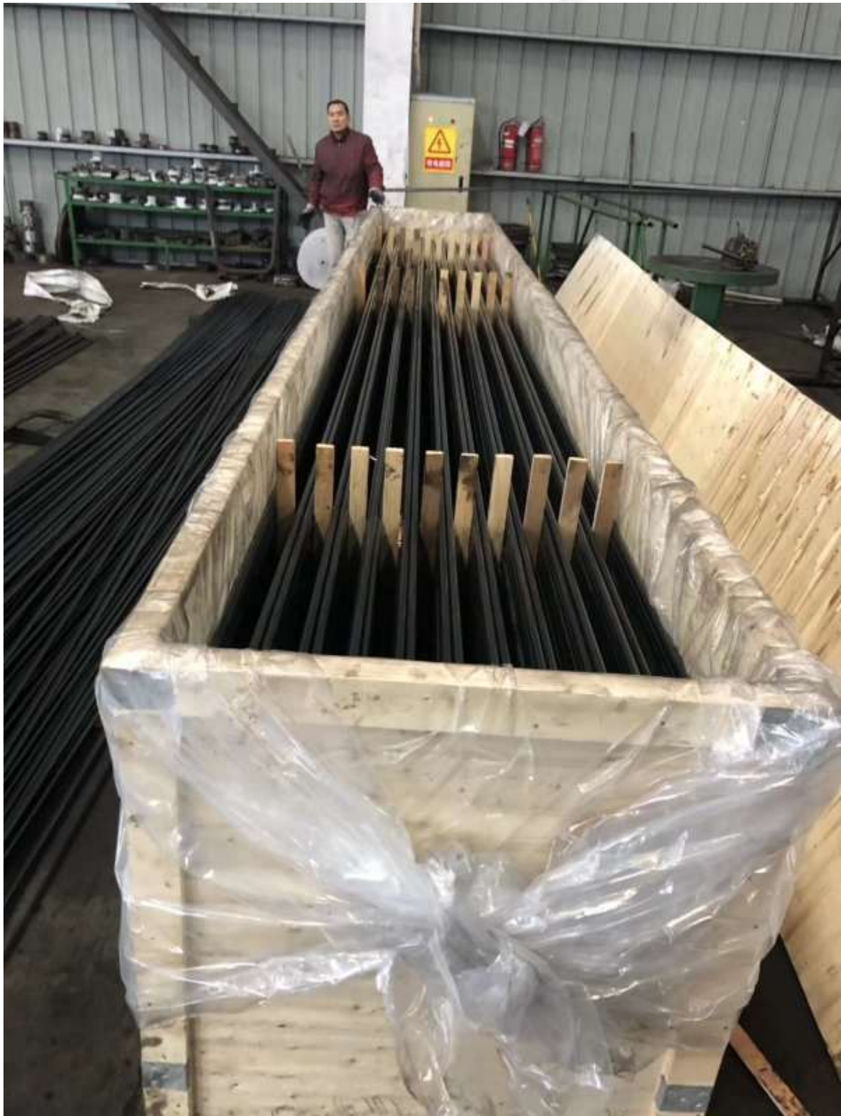
U bend tubes